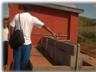
Running water at hand sinks