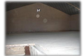
The attic where rice is stored