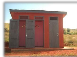
When 100 kids say they've gotta go....