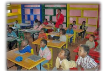
Children learning and book shelves needing filling.