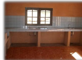
And of course the kitchen sink