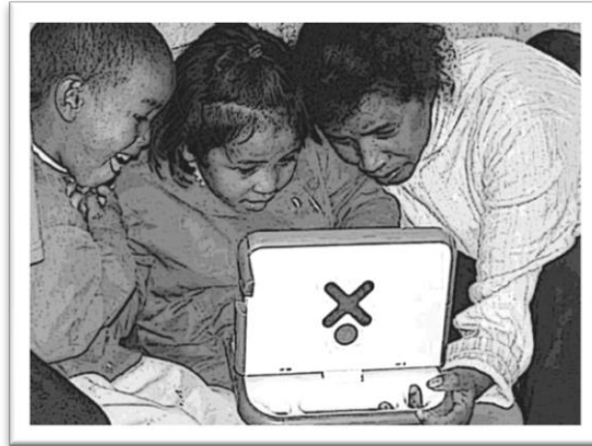
Mom's Blown Away!

Naturally this is very popular amongst the families of the MSP children.